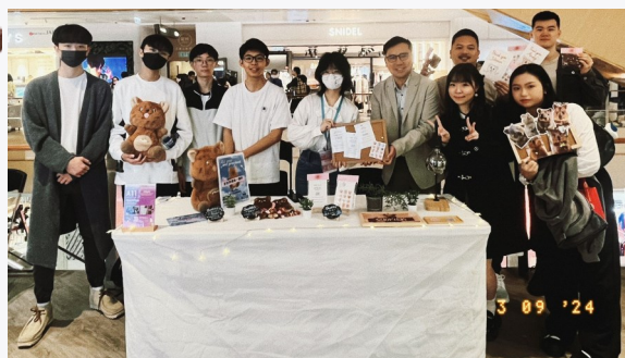
JA 學生營商體驗計劃實驗概念店，中四級 學生在 K11 Art Mall 展銷自家設計的品牌 產品。